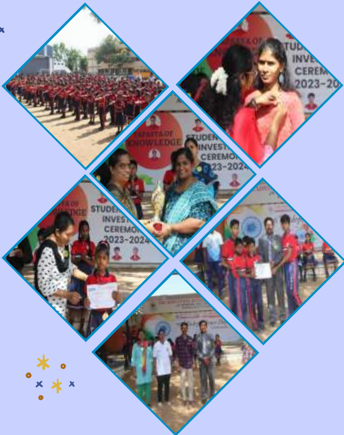
This month the Rolling Trophies goes to grade - IV * A and grade - VI * B.

Congratulations to all the awardees that have shown us that with determination and focus, every goal is attainable. Your achievements inspire us all to aim higher and reach for the stars.