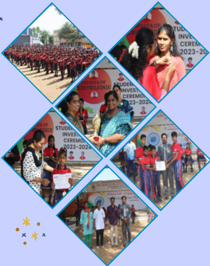
This month the Rolling Trophies goes to grade - IV * A and grade - VI * B.

Congratulations to all the awardees that have shown us that with determination and focus, every goal is attainable. Your achievements inspire us all to aim higher and reach for the stars.